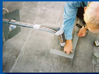
3 Apply MicroSealant Putty Tape to roof (2 layers)