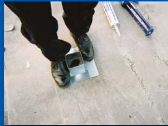
6 Apply pressure to activate bonding