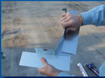
1 Fold EternaPocket at hinges by hand