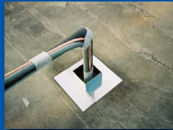
7 Ready for filling