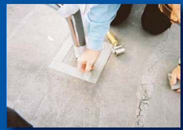
4 Remove both release liners