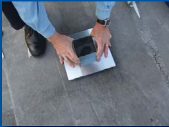
5 Place EternaPocket in position