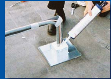
8 Finish installation with EternaPocket Sealant