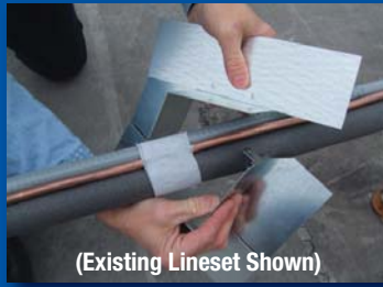
(Existing Lineset Shown)